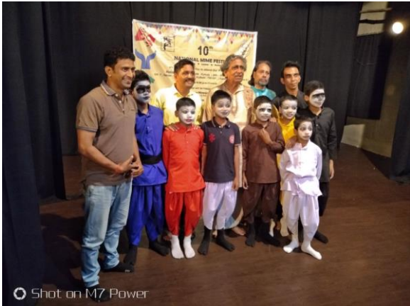
Shot on M7 Power