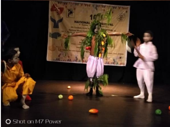
Shot on M7 Power