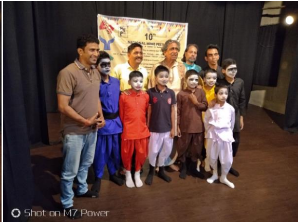
Shot on M7 Power